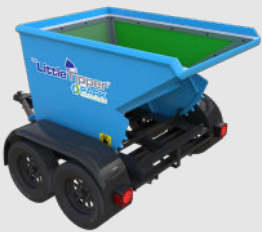
The Little Tipper™