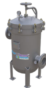
ParKlear™ Bag Filter Vessel