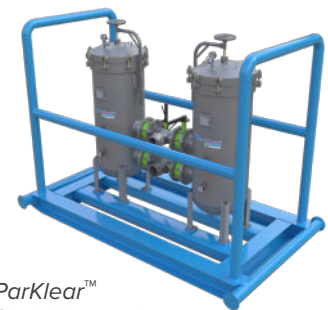
ParKlear™ Skid-Mounted Duplex System