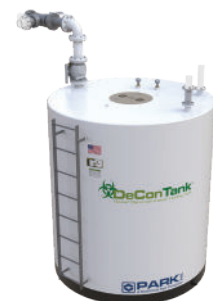
Model DTS (Stainless Steel)