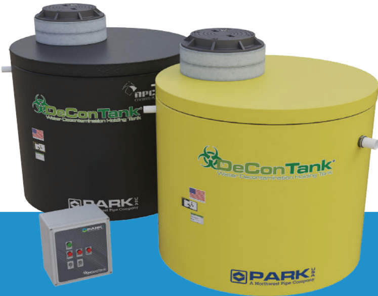
Model DTC (Precast Concrete)