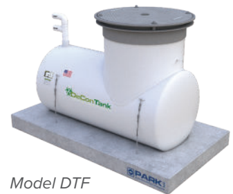
Model DTF (Fiberglass)