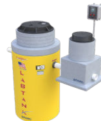
Model ANT-PP with pH Monitoring