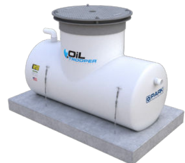
Model AQS Oil-Water Separator (Fiberglass)