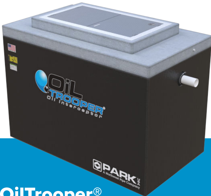
Model SOCMP Sand-Oil Interceptor (Precast Concrete)