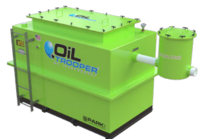
Model SOCMP Sand-Oil Interceptor (Steel)