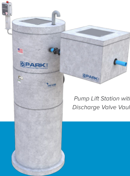
Pump Lift Station with Discharge Valve Vault