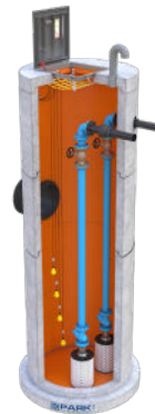
Axial Flow Pump