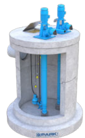
Vertical Turbine Flow Pump